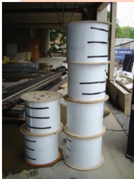
Riser MicroDucts ship on small, easy to handle reels

* Unsupported Bend Radius guidelines should be followed during the installation process. The Supported Bend Radius are post-installation measurements. † Safe working pull strength is calculated at 80% of tensile or breaking strength